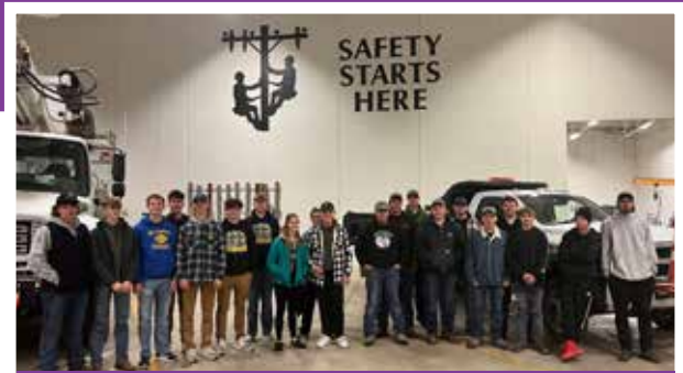
20 high school juniors and seniors participated in Co-op Career Day at ACEC last month