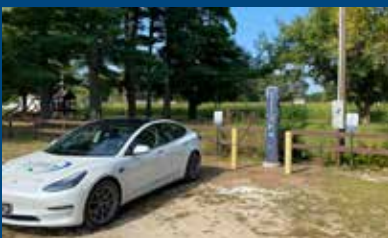
Level 2 EV Charger Installed in Harpers Ferry