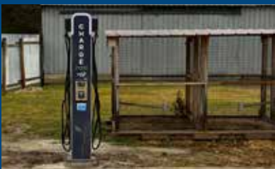
Level 2 EV Charger Installed at Osborne Nature Center in Elkader

Allamakee-Clayton Electric Cooperative recently collaborated with Dairyland Power Cooperative and 31 other electric cooperatives, to form CHARGE EV, LLC. This partnership stretches from Minnesota and Wisconsin to Iowa and Illinois. It represents the opportunity to help build a regional charging network of EV drivers living or visiting our area.